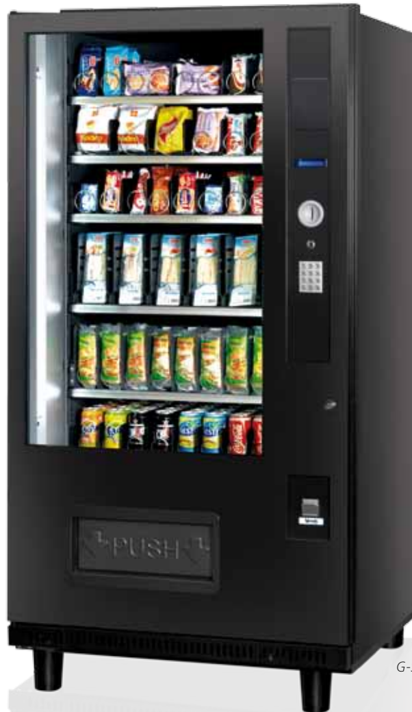
G-Snack Plus 8 Master