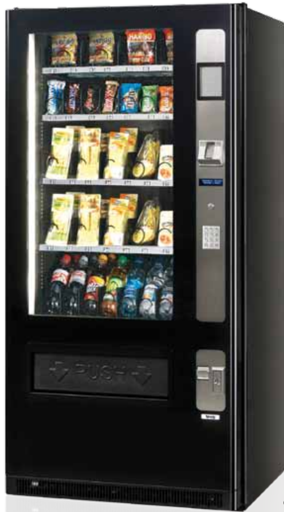
G-Snack Full Snack 810